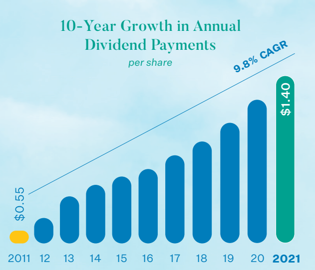
Targeting a compound annual growth rate (CAGR) of more than 7% over the long-term.

A key factor in our history of delivering for shareholders is our working relationship with the California Public Utilities Commission. By carefully navigating the regulatory process, we're able to set rates that are fair to customers and provide a reasonable return on investment. In 2021, we reached an agreement with the Commission's Public Advocates Office on our most recent water rate case, which, if approved, authorizes Golden State Water to invest nearly $405 million over three years in infrastructure for our customers.